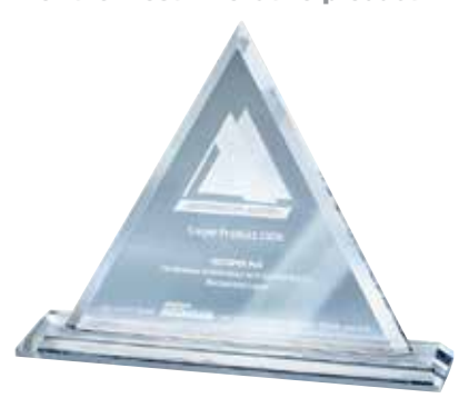
The presentation of the first OCTOPUS with PoE support impressed visitors so much that they awarded this switch first place.

A prize is awarded annually at the SPS/IPC/DRIVES Automation Fair for the most innovative product.